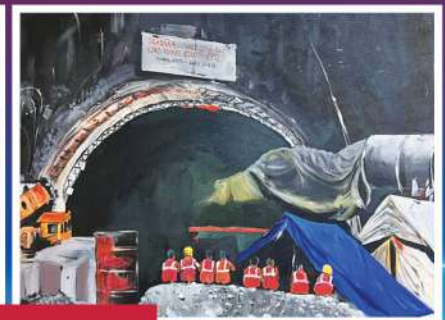
Graphics Work By Student