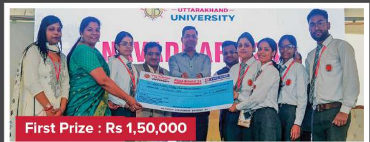
First Prize : Rs 1,50,000

Navadhara is an annual technical fest organized by Dev Bhoomi Uttarakhand University, aimed at providing a platform for students to learn from prominent experts, showcase their technical skills, foster innovation, and promote collaboration among budding technologists. The event aims to bring together students from various schools, colleges and universities to participate in a series of competitions, workshops, and exhibitions centered around emerging technologies and engineering disciplines.