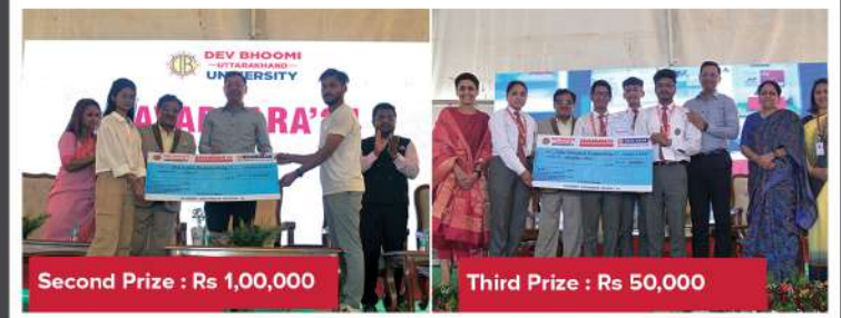
Second Prize : Rs 1,00,000