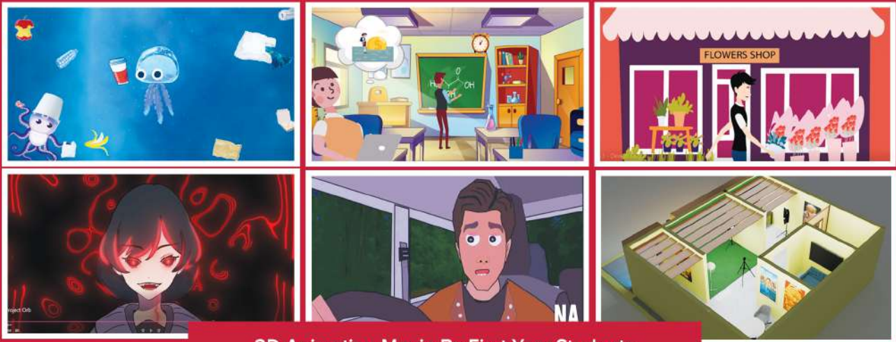
2D Animation Movie By First Year Students

From the first spark of imagination to refined visual storytelling, our students transform ideas into powerful animated and VFX creations. This curated showcase highlights their creative journey — from early experiments in character design and 2D animation to advanced 3D modeling, motion graphics, and cinematic visual effects.